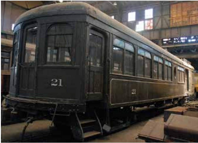
This car was awaiting restoration in the old Sacramento SP shop (now run by the California State Museum) during the 2011 National Convention. This summer we'll be providing our guests with new memories to take home.